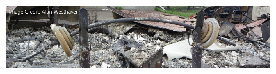
54 World Economic Forum. (2016).

The overall international framework for governance is set out in the Sendai Framework for Disaster Risk Reduction 2015-2030, which Canada and most countries around the world agreed to and ratified in 2015.<sup>56</sup> The four priorities for action of the Sendai Framework are: understanding disaster risk, most importantly, understanding that risk depends on events and exposure and vulnerability; strengthening disaster risk governance to manage disaster risk; investing in disaster risk reduction for resilience; and enhancing disaster preparedness for effective response and to build back better in recovery.